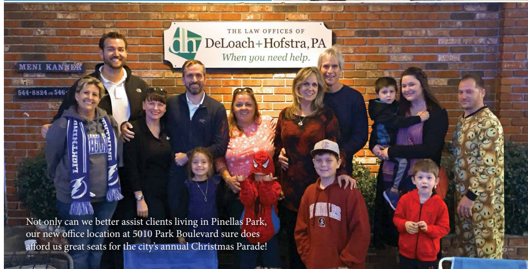
Not only can we better assist clients living in Pinellas Park, our new office location at 5010 Park Boulevard sure does afford us great seats for the city's annual Christmas Parade!