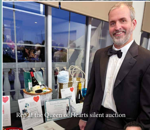
Rep at the Queen of Hearts silent auction